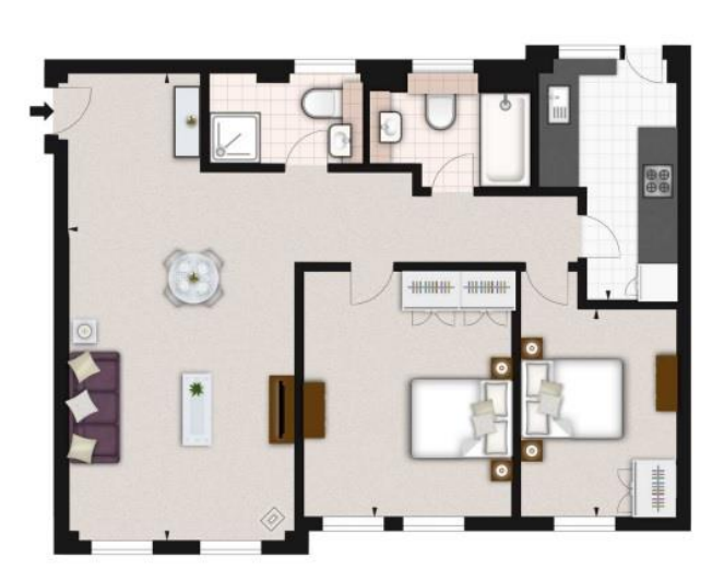
ILLUSTRATION FOR IDENTIFICATION PURPOSES ONLY. NOT TO SCALE * As Defined by RICS - Code of Measuring Practice

APPROX. GROSS INTERNAL AREA ^\star 779 Ft ^2 - 72.37 M ^2